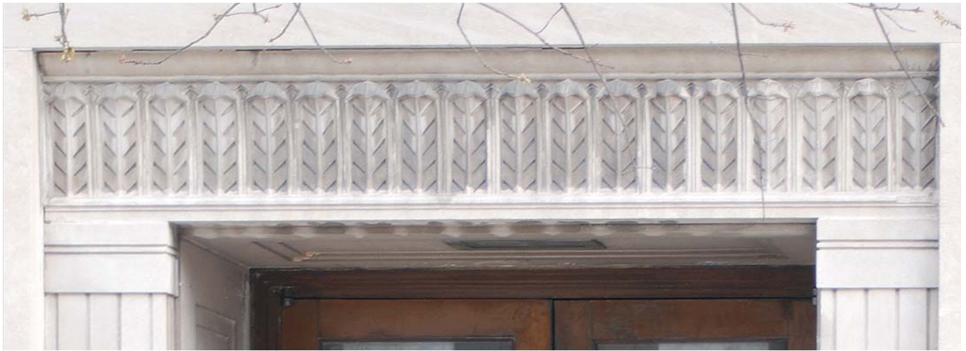
ILLUSTRATION 2: Building Detail

RECORDER OF DEEDS D C NATHAN C WYETH MUNICIPAL ARCHITECT 1941