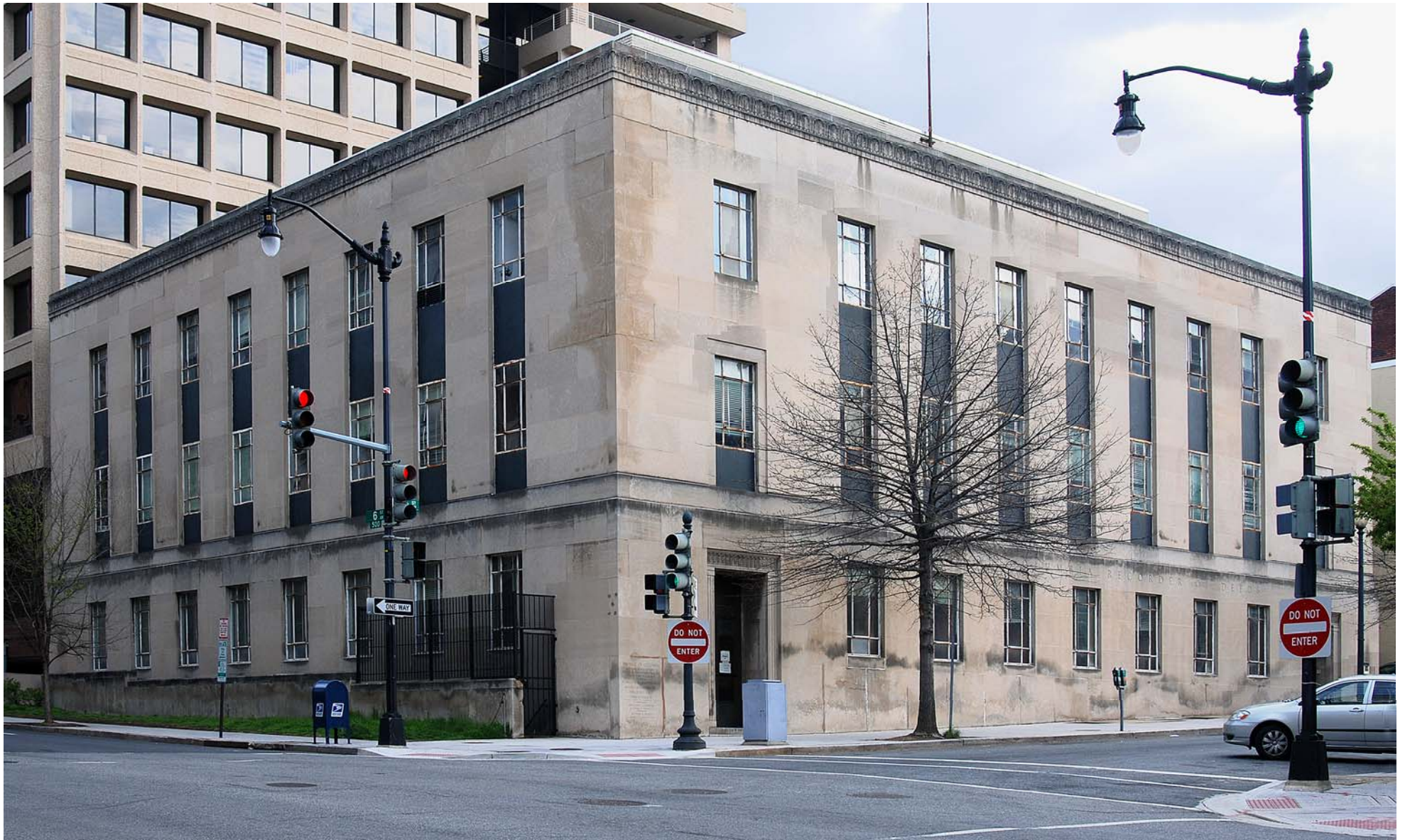
ILLUSTRATION 1: Recorder of Deeds Building (Nathan C. Wyeth, Municipal Architect, 1940-43), viewed from corner of Sixth and D Streets NW.