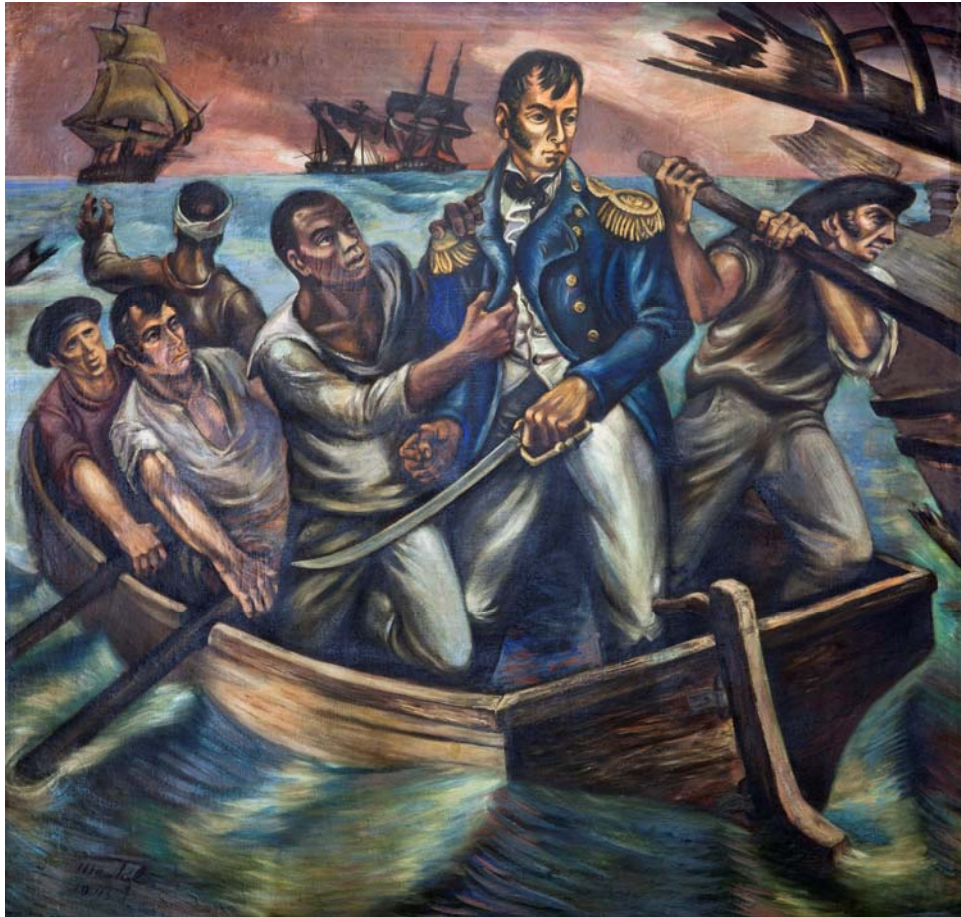
"Cyrus Tiffany in the Battle of Lake Erie, September 13, 1813," by Martyl Schweig