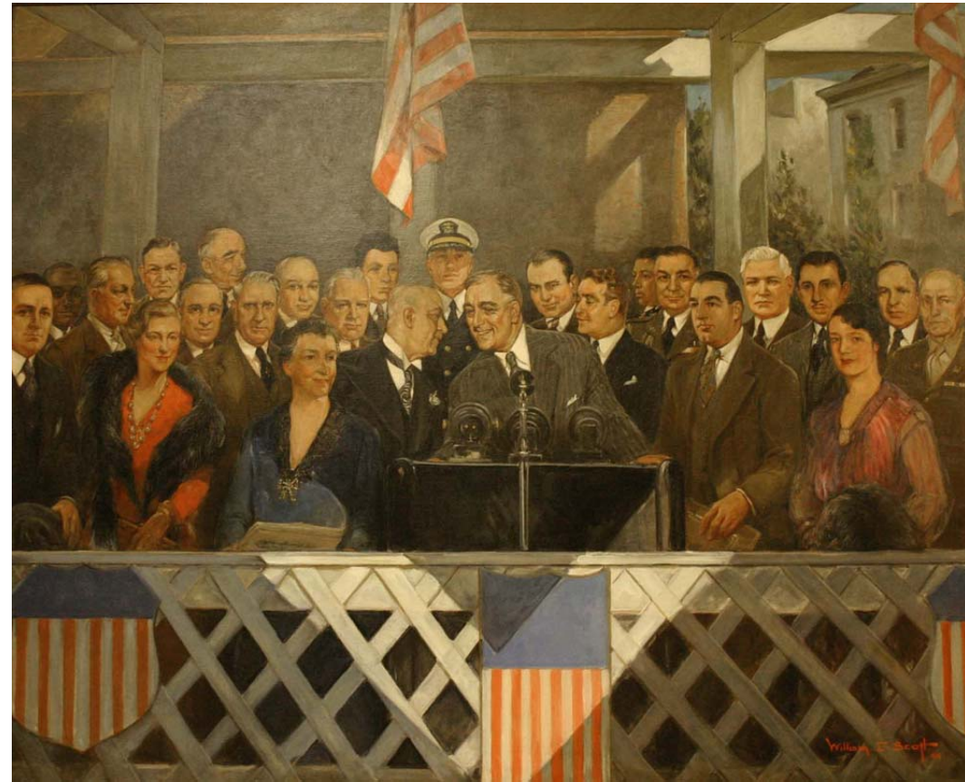
"Groundbreaking" by William Edouard Scott, (1944, oil on canvas)