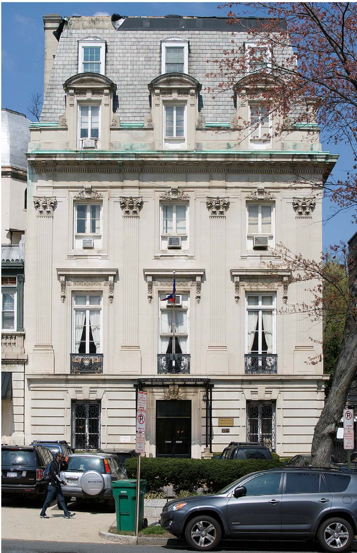
ILLUSTRATION 3: Gibson Fahrenstock House, 2311 Massachusetts Avenue NW, (Nathan C. Wyeth, 1906, constructed 1909-10). Altered after becoming Chinese Embassy 1943, now Embassy of Haiti