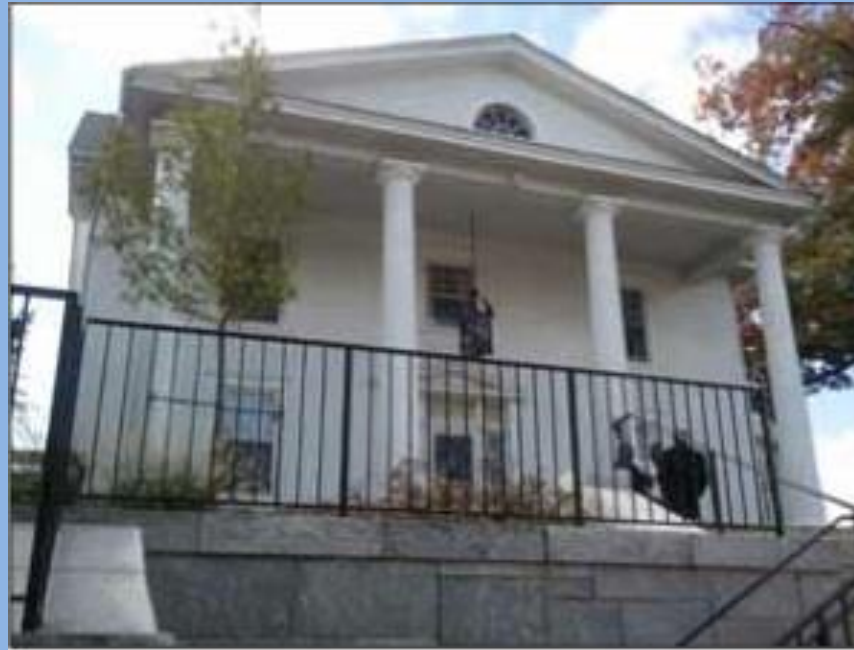
Randle Mansion/Southeast White House 1910 2909 Pennsylvania Ave., SE