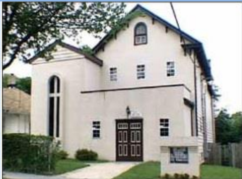
Deane House/New Bible Church - 19 th c. family home