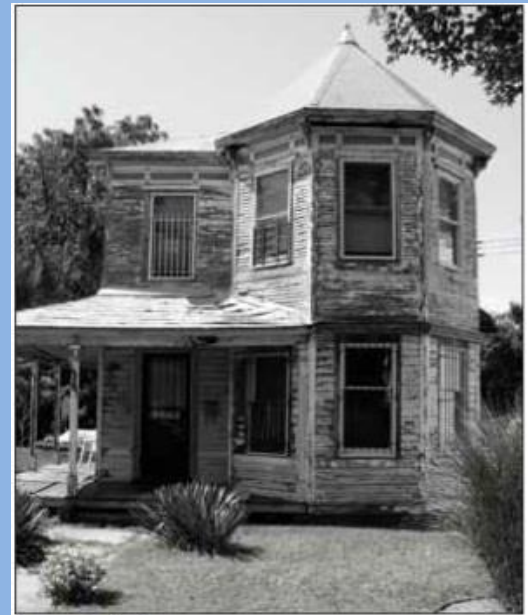
House on Douglas Street