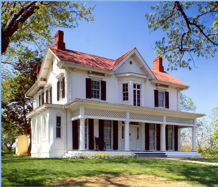
Cedar Hill 1855-1859