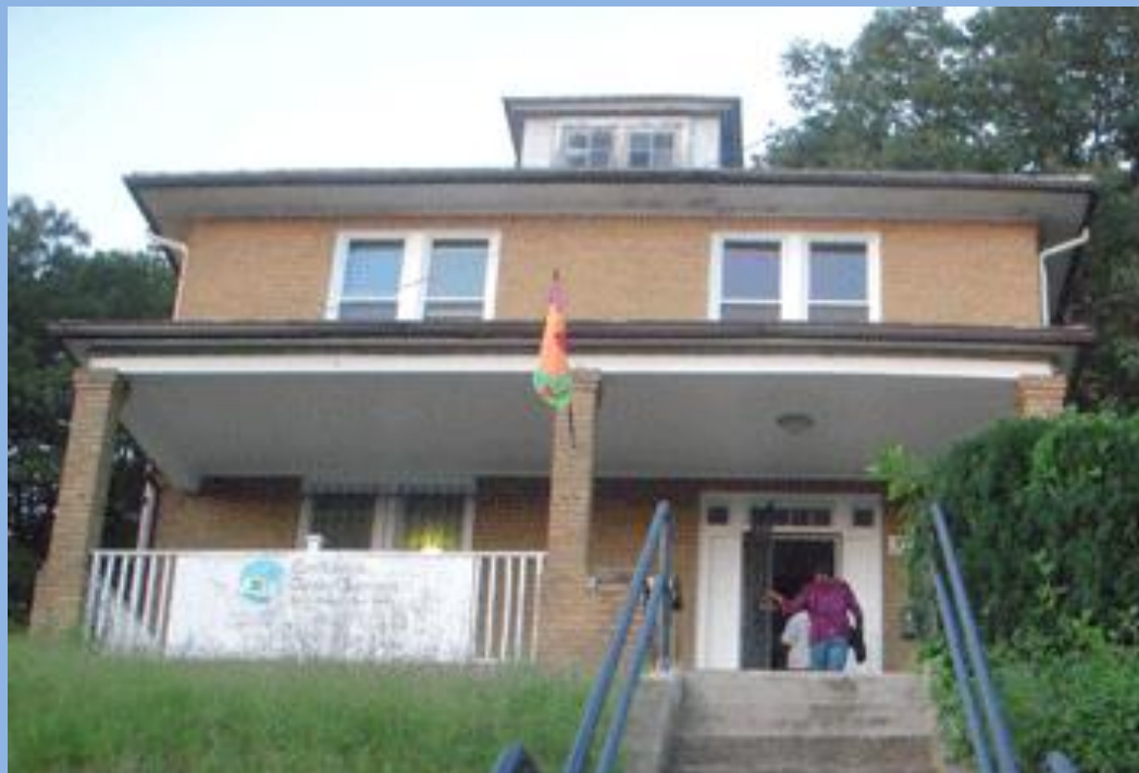
Ctr. for Green Urbanism 3938 Benning Rd.