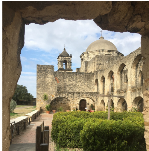
Mission San José.

San Antonio Conservation in the 21st Century Wednesday, August 24th | 12:00pm - 1:00pm EDT