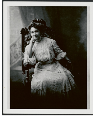
Mary Church Terrell, three-quarter length portrait, seated, facing front. , None. [Between 1880 and 1900, printed later] Photograph. Library of Congress.

DCPL is pleased to announce it was recently awarded a $50,000 grant from the National Park Service to underwrite the research and documentation necessary to produce an historic context study that identifies important themes and sites related to Black women's suffrage and the fight for equal rights in the District of Columbia. Black Women Suffrage in Washington, DC: A Context Study will help piece together the stories of Black women suffragists in the District who are currently underrepresented on both the DC Inventory of Historic Sites and National Register of Historic Places. It will also serve as the basis for future evaluation of properties nominated for inclusion in the DC Inventory of Historic Sites and the National Register of Historic Places. At the conclusion of the project, one new National Register nomination will be written and submitted, and one existing landmark nomination will be amended to include relevant information related to Black women's suffrage. DCPL expects the project timeline will be September 2022 - September 2025.