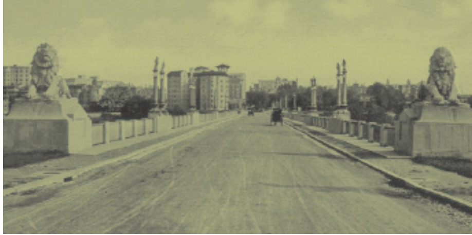
The Taft Bridge, completed in 1907, is notable for its famous lion sculptures designed by Roland Perry. The lions were removed for restoration in 1985, but were found to be beyond repair. Replicas were created by artist Reinaldo Lopez-Carrizo and installed in 2000. The bridge is listed in the DC Inventory of Historic Sites and the National Register of Historic Places.

In addition to the park and zoo, other historic elements of Woodley Park are its churches and schools. The All Souls Memorial Episcopal Church, located at 2300 Cathedral Avenue, was built in 1914 at the eastern edge of today’s historic district. In 1912, the Catholic Church purchased land to house St. Thomas Apostle Church at 27th Street and Woodley Road. An associated Catholic school occupied the townhouses across from the church for a number of years. The District soon opened the public Oyster School to accommodate the growing number of schoolchildren in the neighborhood. Built in 1926 at Calvert and 29th Streets, the original building was demolished and rebuilt in 2001 as the city’s only bilingual public school.