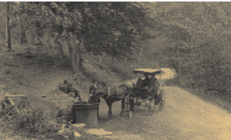
Pleasure riding through Rock Creek Park has always been popular, whether by buggy, horseback, or automobile. Historically, owners of nearby property could ride horses from their homes throughout the park. Today, horseback riding is limited to 13 miles of bridle paths at the northern end of the park.

The proximity of the park was undoubtedly a selling point for Woodley Park. The miles of bridle paths and acres of undeveloped land for exploration attracted some of the earliest homebuyers to the area.