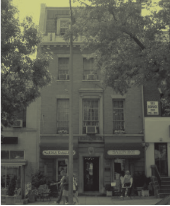
This elegant townhouse at 2602 Connecticut Avenue was designed by Clarke Waggaman and is now used for commercial purposes. The stylized neoclassical building retains such original features as the lion-head keystone and Greek key panel above the door and the articulated brick base meant to imitate rusticated stone. D.C. Historic Preservation Office