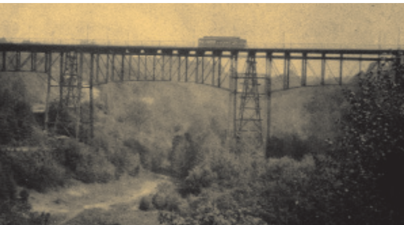
As early as 1893, the Rock Creek Railway ran on a 20-minute week-day schedule in winter, with a car every 12 minutes in summer to accommodate riders going to Rock Creek Park, the zoo, and Chevy Chase Lake. As homes were built in Woodley Park, many residents caught one of the 25 streetcars in service along the new Connecticut Avenue and crossed this Calvert Street trestle bridge to reach federal jobs downtown.

However, the rail line and residential development would have to wait. In 1888, Congress passed an “Act to Regulate the Subdivision of Land Within the District of Columbia” which extended L’Enfant’s street grid to areas outside the original city boundaries. New subdivisions in Washington County were required to follow the city’s established alignment of orthogonal streets and diagonal boulevards. Subdivisions like Woodley Park that were designed with curving streets were faced with the possibility of total street redesign and the potential for condemnations of property to conform to these requirements. The confusion surrounding the new law hindered any development in Woodley Park.