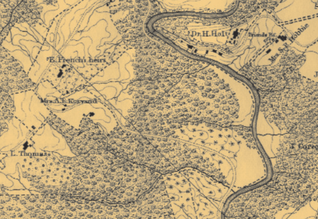
Boschke's Topographical Map of the District of Columbia shows the look of the Woodley Park area in 1861, prior to subdivision. Notice the winding road, Woodley Lane, which provided the main transportation route through the hilly area until Connecticut Avenue was constructed.

The earliest settlers in the Woodley Park area arrived by wagon and carriage on dirt roads. Woodley Lane provided the main route for travelers, as Connecticut Avenue had not yet been extended north of Rock Creek. An 1887 description portrays the difficulty of travel to this area from downtown, stating that Woodley Lane was “a country road, winding its way down the hillside, crossing the creek on a wooden bridge a few feet above the level of the stream, and thus making the difficult and circuitous ascent to the greater elevation of Tennallytown Pike” (Wisconsin Avenue). The old Woodley Lane roughly followed today’s 24th Street, Woodley Road, 29th Street, and Cathedral Avenue.