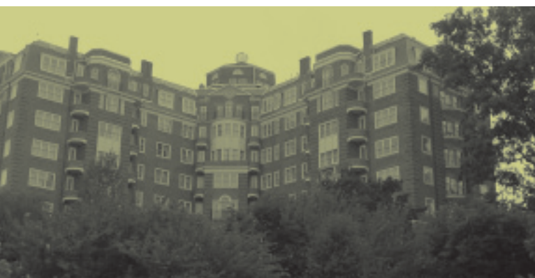
Although the original Wardman Park Hotel was demolished, the Wardman Park Tower (or Annex) at the corner of Woodley Road and Connecticut Avenue remains. Built as a luxury residential hotel, the Tower has served as the home to presidents, vice "presidents, celebrities, members of Congress, and chief justices.

The late 1920s and 1930s saw the construction of higher and denser apartment buildings. In 1928, Mihran Mesrobian designed an annex to the Wardman Park Hotel. Harry Wardman demolished his own residence on the southwest corner of Connecticut and Woodley Road to make room for the new eight-story highrise, which Mesrobian designed in a cruciform plan with Georgian Revival details. Four wings extend off an octagonal central core with graceful semicircular balconies at each end. At 140 feet above street level, the Wardman Park Tower, which is topped with an iron globe, dominated the skyline when it was built. Its hill-top location and height still afford residents and guests stunning views of the city and park.