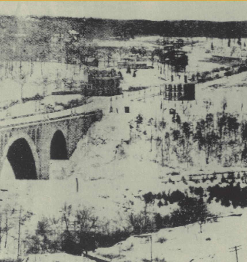
Woodley Park in winter looking northwest over Connecticut Avenue bridge, 1908.