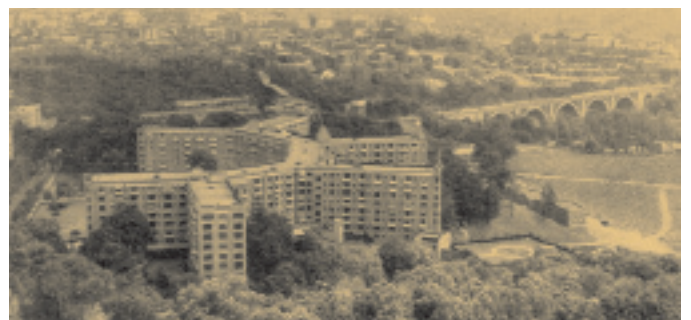
The Wardman Park Hotel, called “Wardman’s Folly” during construction because it was considered too far from Washington, was nevertheless a huge success. It was filled to capacity almost immediately, with some residents moving in before construction had been completed.