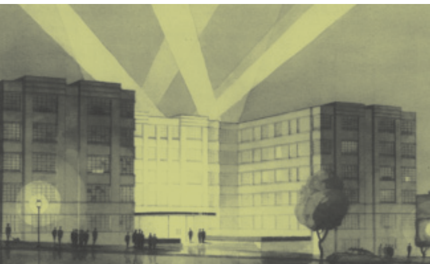
The Delano apartment building at 2745 29th Street was designed in 1941 by George Santmyers. The International style of the building is reflected in its modern flat form, use of glass and steel, and stream-lined edifice.

With the exception of a few retail shops, which were permitted despite great conflict among residents, businesspeople, and the DC Zoning Commission, Woodley Park remained essentially residential throughout the first two decades of the 20th century. In 1921 the shop at 2606 Connecticut Avenue was constructed as the first purpose-built commercial building in Woodley Park. The city's 1920 zoning regulations did not permit commercial development in this part of the city, so the case went all the way to the Supreme Court to determine whether or not the commercial use could be permitted.