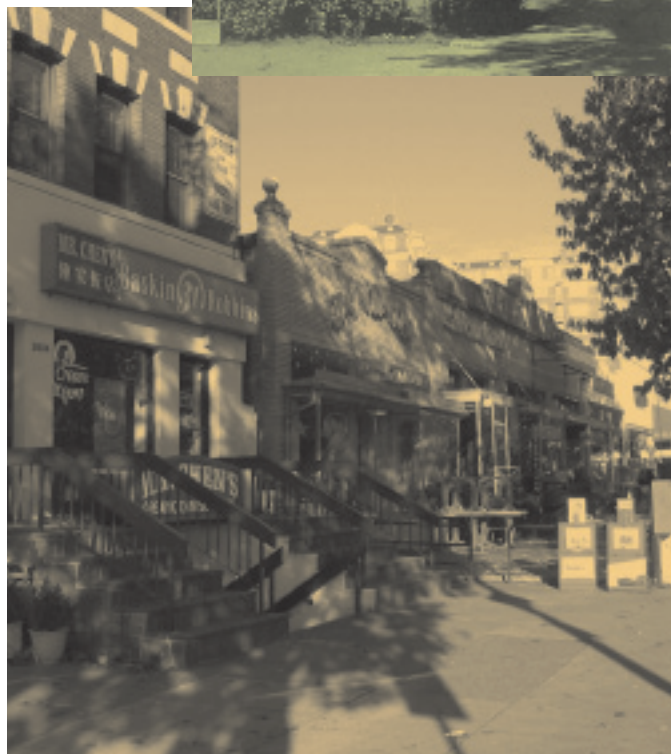
Taken in 1949 and 2004, these two photos show how little the commercial character of the 2600 block of Connecticut Avenue has changed in the past 50 years. Typical of commercial architecture of the period, the center buildings are one story with a parapet roof and corner finials. Commercial architecture of the period typically used a vocabulary of restrained classicism with flat limestone facades embellished with stylized classical ornamentation such as pilasters, swags, and urns.