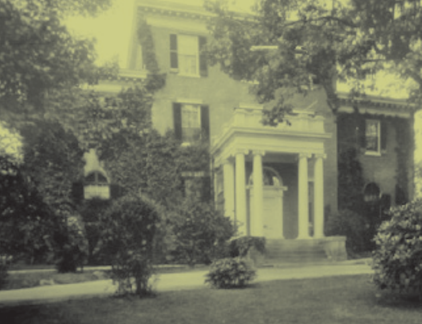
Typical of the Federal style, the brick house called Woodley was symmetrical and restrained, with doorway fanlights and a denticulated cornice over the main three-story block and the two-story wings. Pictured here in an early view before additions, the mansion has been home to the Maret School since 1952.