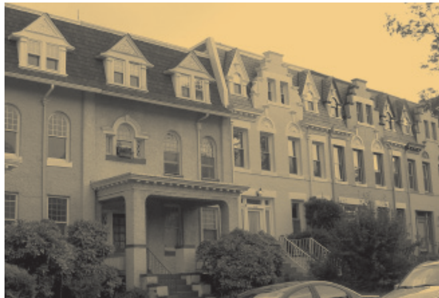
Harry Wardman had these rowhouses on Garfield Street built in 1908 in an eclectic style with a range of architectural embellishments such as Palladian windows, Flemish gables, and scalloped arches. In 1914, typical residents included businessmen, government workers, a senator, and a Treasury Department official.

As Woodley Park transformed into a flourishing neighborhood, Connecticut Avenue became a fashionable address. Grand townhouses featured limestone facades, ornate keystones over windows and doors, and decorative stone relief panels. On 27th, 28th, 29th, and Garfield Streets, developers built more modest brick rowhouses with Flemish, Mediterranean, and English influences, individualized by alternating the use of covered and uncovered porches, varying the fenestration patterns, and using an assortment of roof forms, materials, and dormer styles.