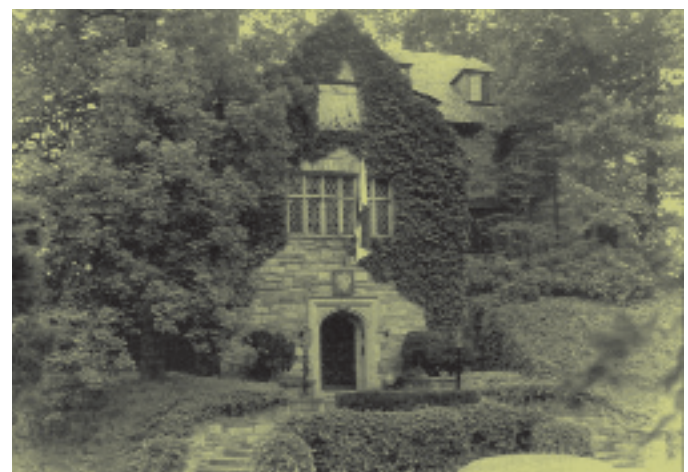
The house at 2601 29th Street demonstrates the romantic English influence in its stone exterior, diamond-pane windows, and Tudor arched entry. Photographed here in 1945, the building served at that time as the Embassy of Panama.

Advertisements for these homes ran in the Washington Star newspaper, touting a sales price of $17,500 and offering assurance against further encroachment on the “tree-crested hills surrounding Woodley Park.” Wardman and other builders continued the English theme on Cortland, 28th and 29th Streets.