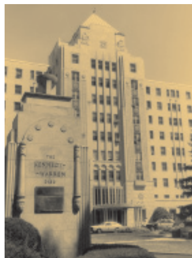
The impressive Kennedy-Warren apartment building at 3133 Connecticut Avenue is one of the finest examples of Art Deco design in Washington. After a construction hiatus of over 70 years, the second tower was completed in 2005 according to the original designs and using the originally specified materials.

Started just a few years after the Wardman Park Tower, the Kennedy-Warren Apartments illustrates the change in architectural style that emerged in the 1920s and '30s. Designed by Joseph Younger for investors Edgar Kennedy and Warren Monroe, the Kennedy-Warren is one of the District's premier examples of Art Deco architecture. It went up at 3133 Connecticut Avenue in 1931 and was the first building in Washington to make extensive decorative use of aluminum on both the exterior and interior. The design placed an emphasis on verticality and featured Aztec designs on the interior and fine streamlined finishes throughout.