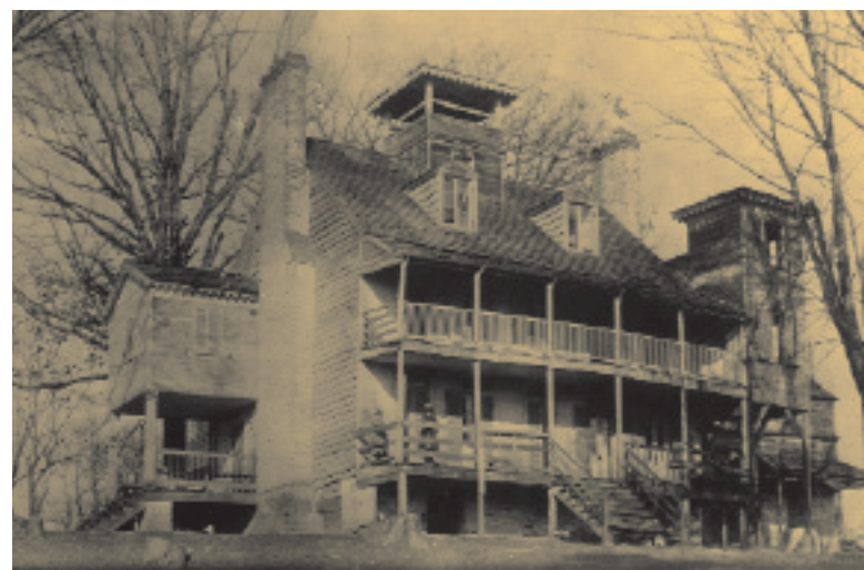
Redwood stood across Connecticut Avenue from today's entrance to the National Zoo. Built about 1819, the frame house featured a full-width two-story porch and roof deck for enjoying the view of the city and surrounding countryside.

During the Civil War, Union soldiers looted Redwood's large fruit orchards and forced the homeowners to flee into the city. The large frame dwelling later became a fashionable resort, but was razed in 1920 to make way for the Cathedral Mansions apartments.