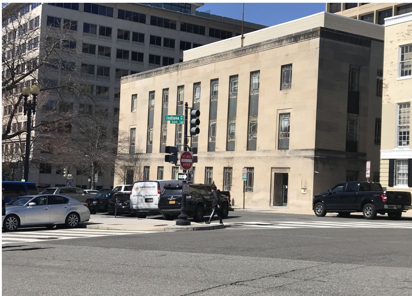
Recorder of Deeds Building, 515 D Street, NW