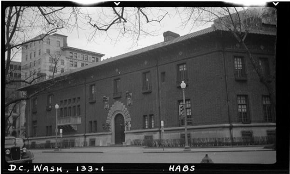
The John R. McLean House, once located at 1500 I Street NW, and documented by HABS in 1939.