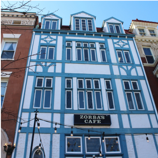
Image of Zorba's Café, a long-standing Greek restaurant in Dupont Circle.

For over two centuries, Washington, DC has functioned as a center of urban life. As the city has grown and evolved, commercial businesses have benefited the population through providing services and spaces important to the community. Several municipalities and historic preservation non-profits around the nation have explored the topic of legacy businesses, as these commercial establishments retain various tangible and intangible aspects important to historic preservation. In April 2023, the DC Preservation League is focusing on legacy businesses to highlight DC's long-standing businesses and honor their history, social value, and cultural impact on the city at large.