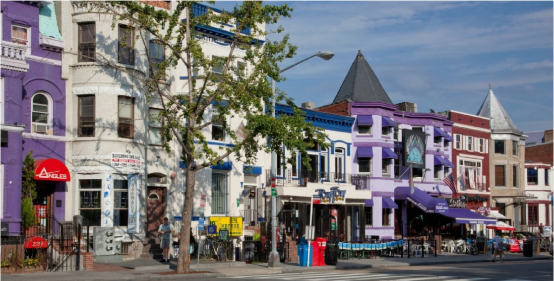
Washington Heights Historic District.

The DC Preservation League (DCPL) is pleased to announce it will partner with the DC Office of Planning's Historic Preservation Office (DC HPO) to implement a $50,000 grant from the National Park Service to develop The History of Latino Communities in Washington, DC: A Context Study.