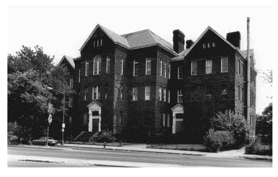
Photo of the former M Street High School in 1986, when the building was added to the National Register of Historic Places.

M Street High School: Where Trailblazers Thrived