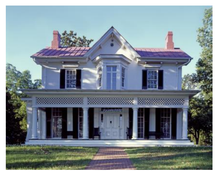
Image of Cedar Hill, taken by Carol Highsmith. Photo courtesy of the Library of Congress.

Saturday, February 17th, 2:00 - 3:00 PM EDT In-Person | 1411 W Street SE