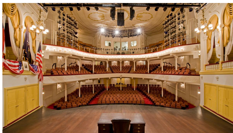
Interior of Ford's Theatre.

Wednesday, November 20th, 12:00 PM - 1:00 PM EDT Virtual, Zoom