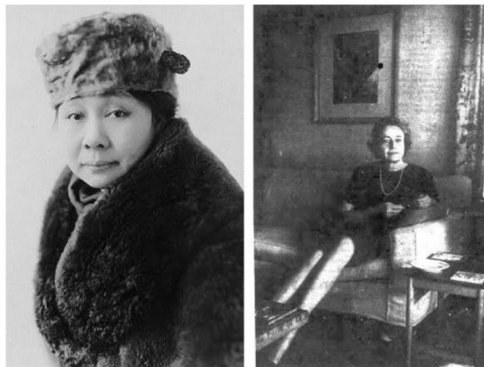
Left: Reyes de Veyra in 1921 Right: Shackleton in 1970

On October 24, 2024, the Historic Preservation Review Board added two new historic landmarks to the DC Inventory of Historic Sites: the Sofia Reyes de Veyra Residence (2610 Cathedral Avenue NW) and the Pauline "Polly" Shackleton Residence (3232 Reservoir Road NW). The nominations will now be forwarded to the National Park Service for inclusion in the National Register of Historic Places. These two nominations were submitted by the DC Preservation League to the Historic Preservation Office as part of The Women's Suffrage Movement in Washington, DC: 1848-1973 Historic Context Study .