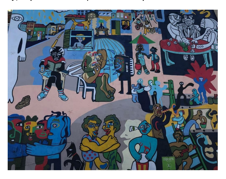
Photo of the 1970s mural painted by Carlos Salazar, "Un Pueblo Sin Murales es Un Pueblo Dismuralizado" (A people without murals is a demuralized people), courtesy of Zachary Burt.

Latino Context Study: Public Webinar (Virtual) Wednesday, September 25th | 12:00 - 1:00 pm EDT