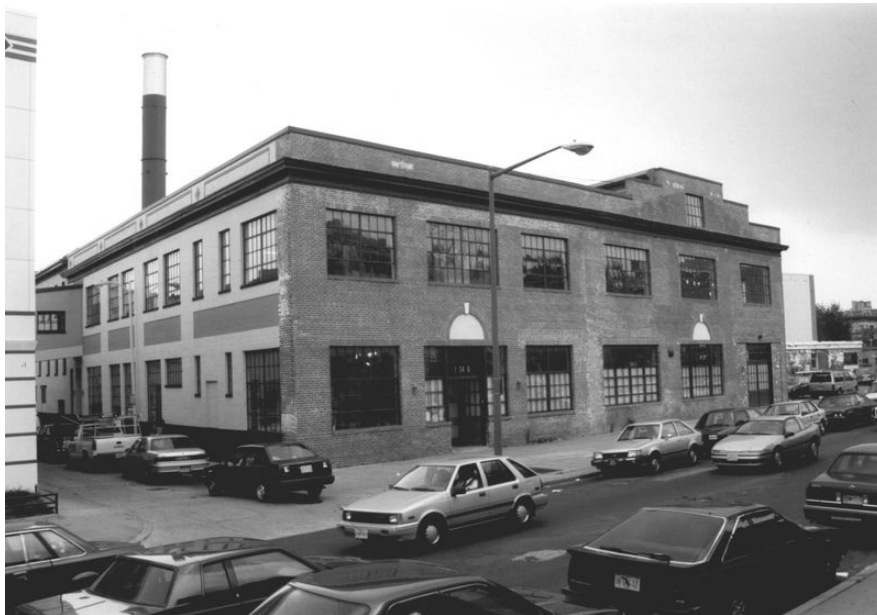
Manhattan Laundry, Street View.

New Year, New Office 1328 Florida Avenue NW, 2nd Floor