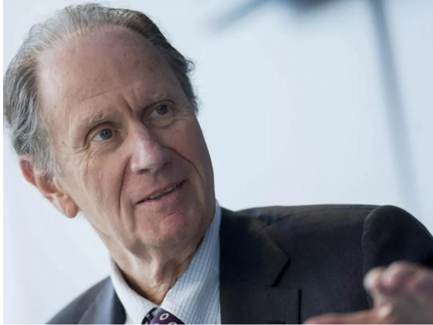
David Bonderman (1942-2024)