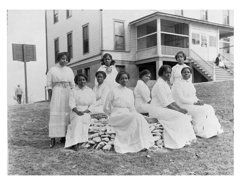
Photograph of the National Training School for Women & Girls.

Monday, March 31, 2025, 6:00 - 9:00 PM Virtual, Zoom