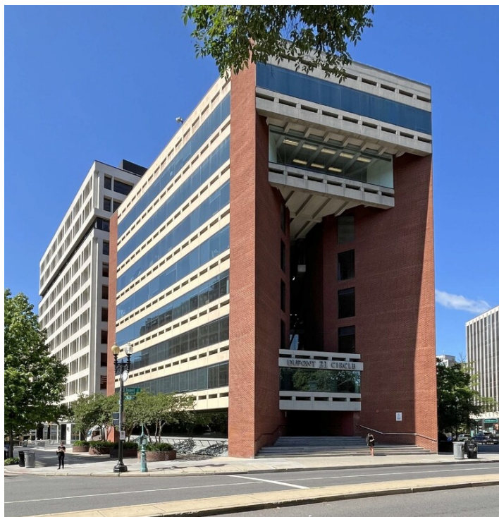
Photo of the Euram Building, located at 21 Dupont Circle NW.

On May 1, 2025, the Historic Preservation Review Board designated the Euram Building , located at 21 Dupont Circle NW, as a historic landmark listed in the DC Inventory of Historic Sites. At the meeting, the Board also requested that the nomination be forwarded to the National Park Service for inclusion in the National Register of Historic Places. DC Preservation League, a longtime advocate for Modern architecture, submitted the landmark nomination in January 2025.