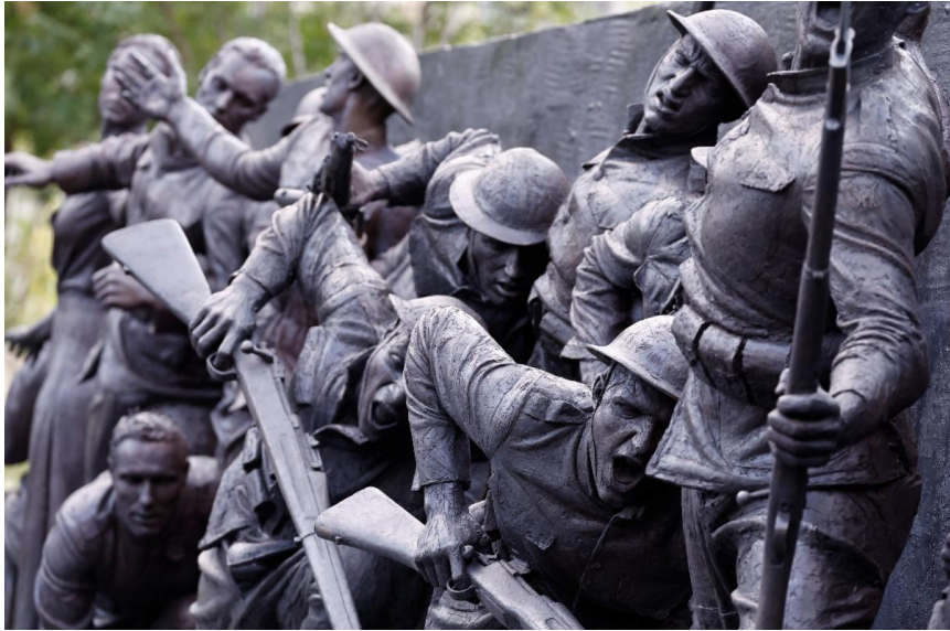
Photo of the National World War One Memorial.

Saturday, May 31, 2025, 11:00 AM - 12:00 PM In-Person, National World War One Memorial Pennsylvania Avenue & 14th Street NW