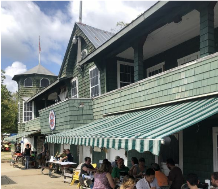
Photo of the Shingle style Washington Canoe Club, the location of DC Preservation League's annual Crab Feast.

The Washington Canoe Club is nearing the end of a decade of planning and reviews to restore its 120-year-old boathouse. The first phase, projected to begin in January 2026, will include the stabilization of the entire structure; repairs and replacement to doors, windows, and roof; and installation of locker rooms and toilet/shower facilities. The club is well along toward reaching its $1 million goal, and will also use reserves (and possibly loans) to meet the $2.5 million budget for Phase 1. The National Park Service is currently reviewing the proposed architectural and engineering plans.