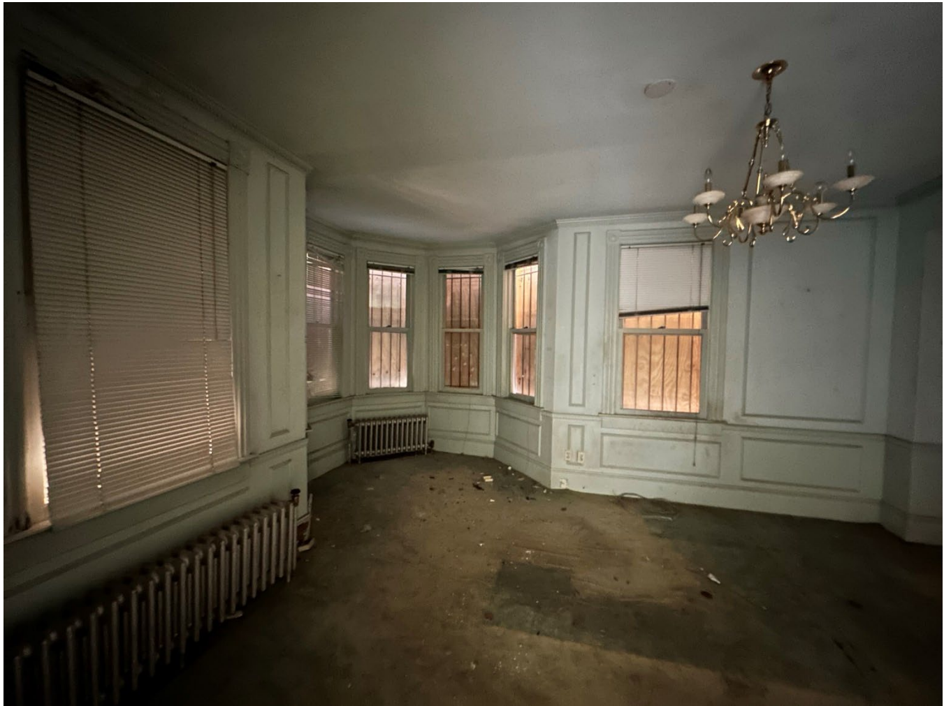
Photo 23: Sherwood Farmhouse first floor south room, view south from entry hall.