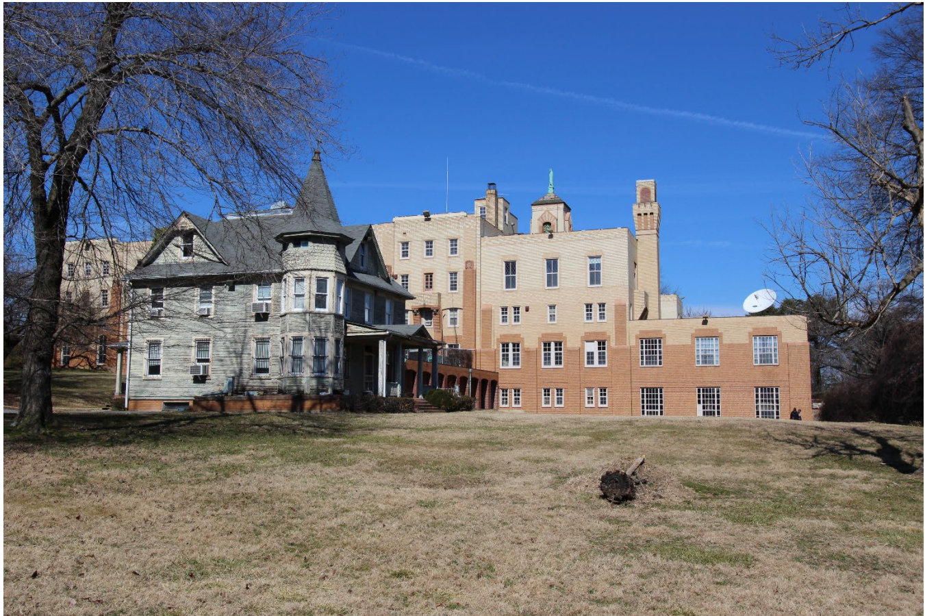
Photo 15: Sherwood Farmhouse with Holy Name College in background, view north.