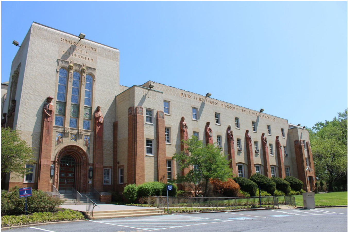
Photo 3: Holy Name College west elevation and entrance, view southeast.