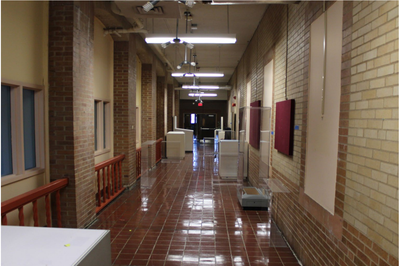
Photo 17: Holy Name College first floor corridor in the south wing, view east.