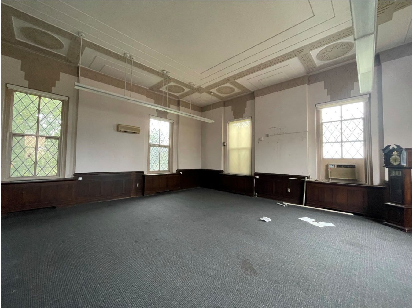
Photo 20: Holy Name College second floor meeting room in north wing, view northeast.