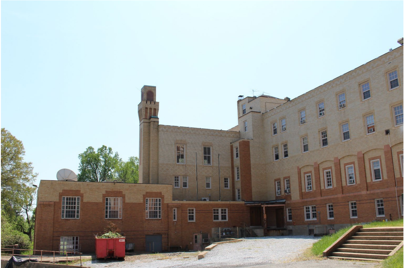
Photo 7: Holy Name College east (rear) elevation parking area, view south.