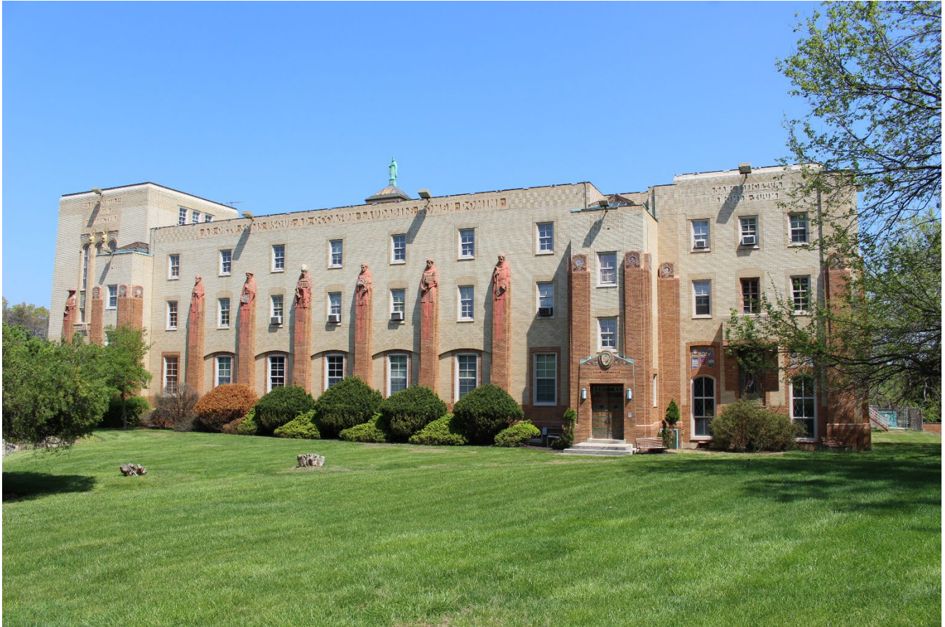
Photo 2: Holy Name College west elevation (façade), view northeast.