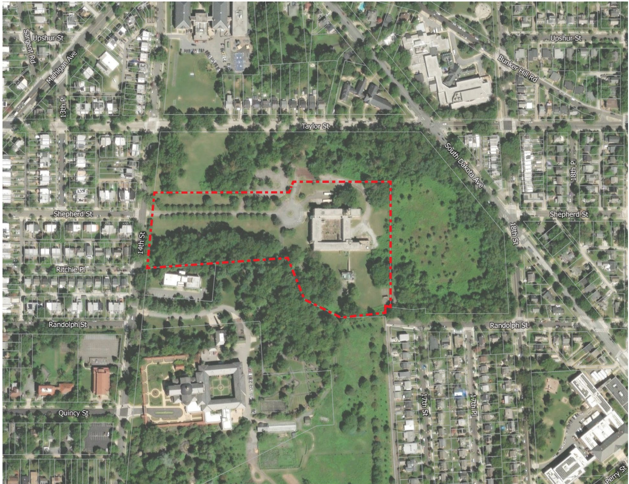
Map 1: 2024 aerial showing location of Holy Name College and Sherwood Farmhouse, 1400 Shepherd Street NE, landmark boundary (outlined in red).