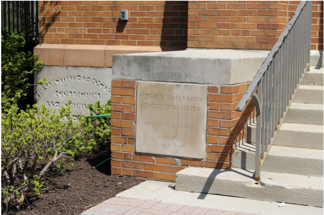
Photo 5: Original and 1984 cornerstones at entrance, view northeast.