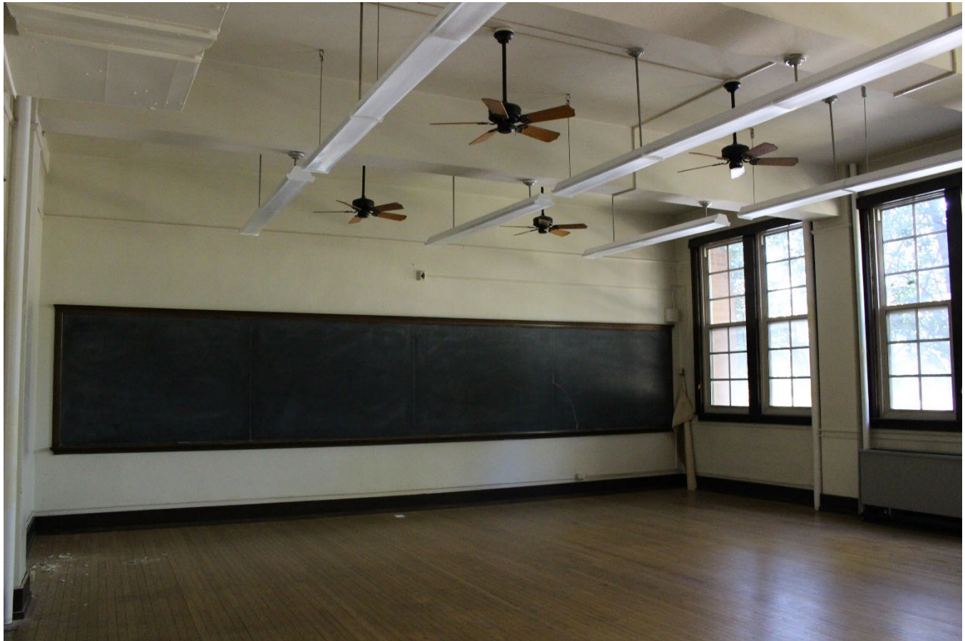
Photo 18: Holy Name College first floor classroom, view northwest.