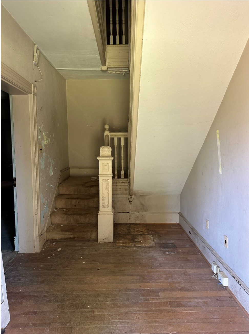
Photo 22: Sherwood Farmhouse first floor entry hall and stair, view west.