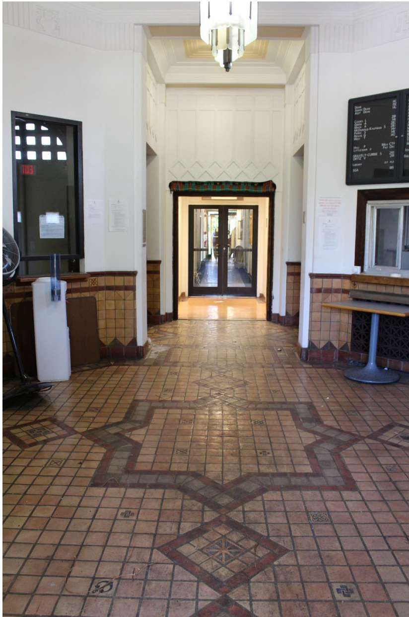
Photo 16: Holy Name College first floor entrance vestibule, view south.