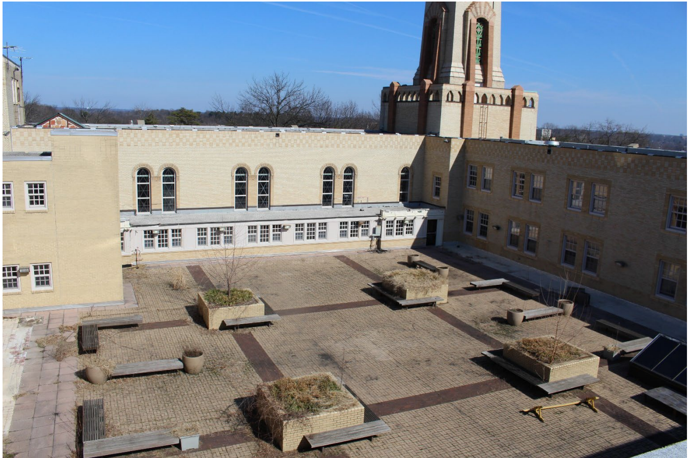
Photo 11: Holy Name College courtyard elevations and courtyard above 1980s library infill, view northeast.