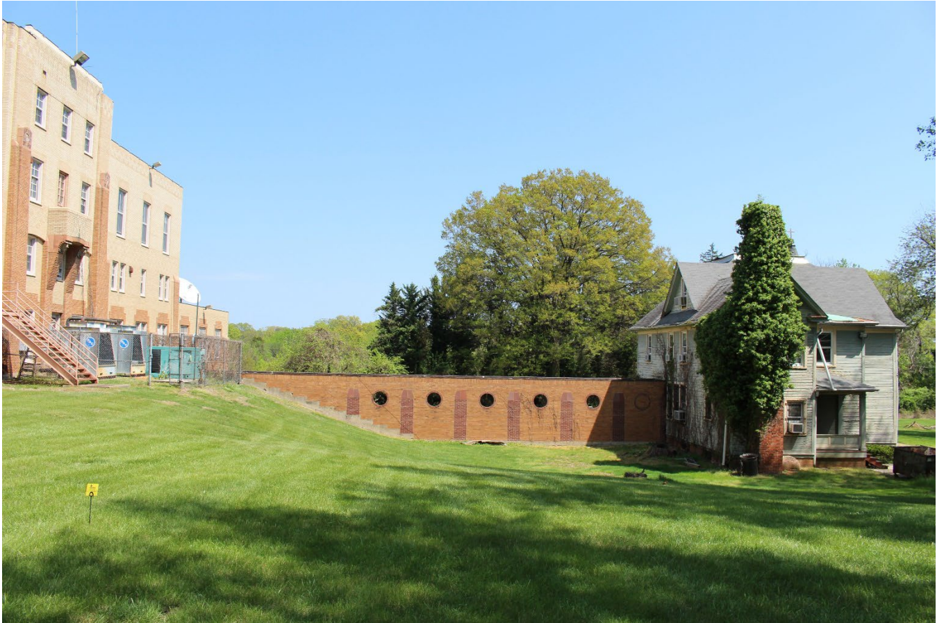
Photo 12: Holy Name College (left), Sherwood Farmhouse (right), and connecting walkway, view east.