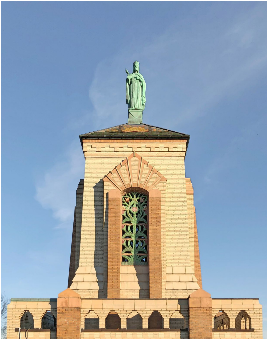
Photo 10: Detail of Holy Name College bell tower, view east from roof.