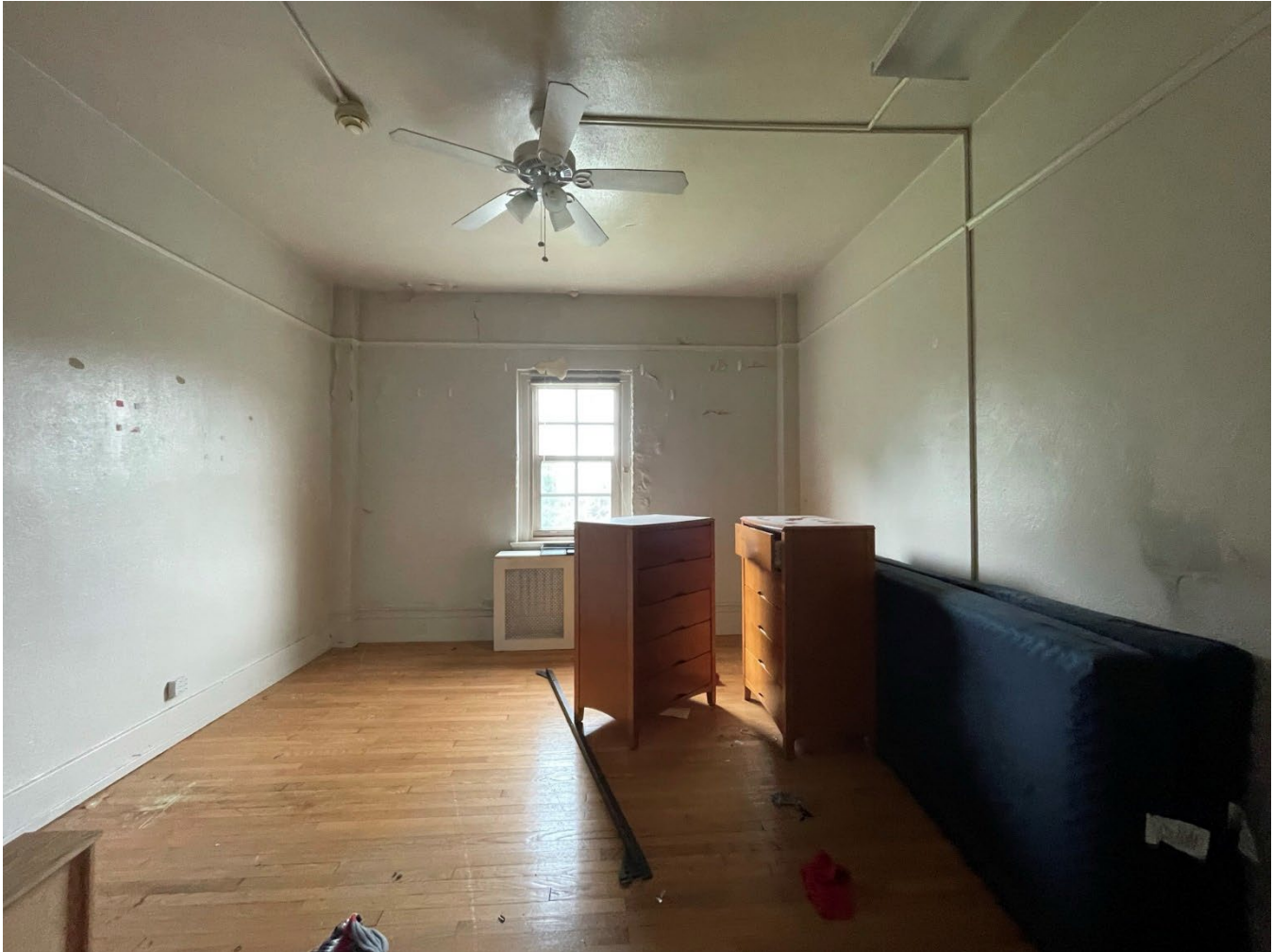
Photo 21: Holy Name College third floor typical dormitory room, view south.