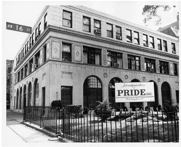
Youth Pride, Inc., 1536 U Street NW. This building was first identified through a historic context study documenting DC's Black Power Movement, 1966-1978, and is now listed in the National Register of Historic Places.

It can be difficult to determine which buildings and structures are the most historically significant to a community. Thus, historic context studies and multiple property documents are an important first step in nominating and designating historic landmarks. These documents provide a thematic context — typically focused on a specific period of time — related to a particular building type or ethnic group, and identify historic sites that may be eligible for historic landmark designation. These sites are then evaluated for potential nomination to the DC Inventory of Historic Sites and the National Register of Historic Places.