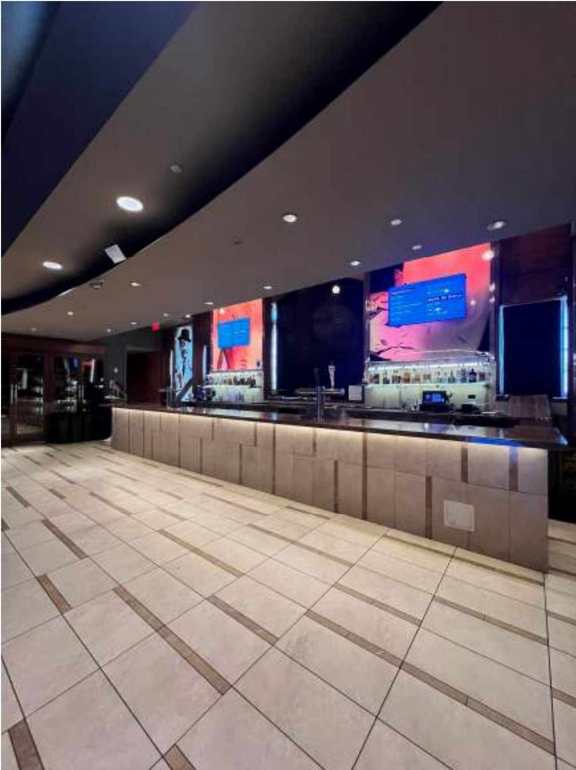
Photo #17 DC_Howard Theatre_0017 Second floor bar, looking northwest