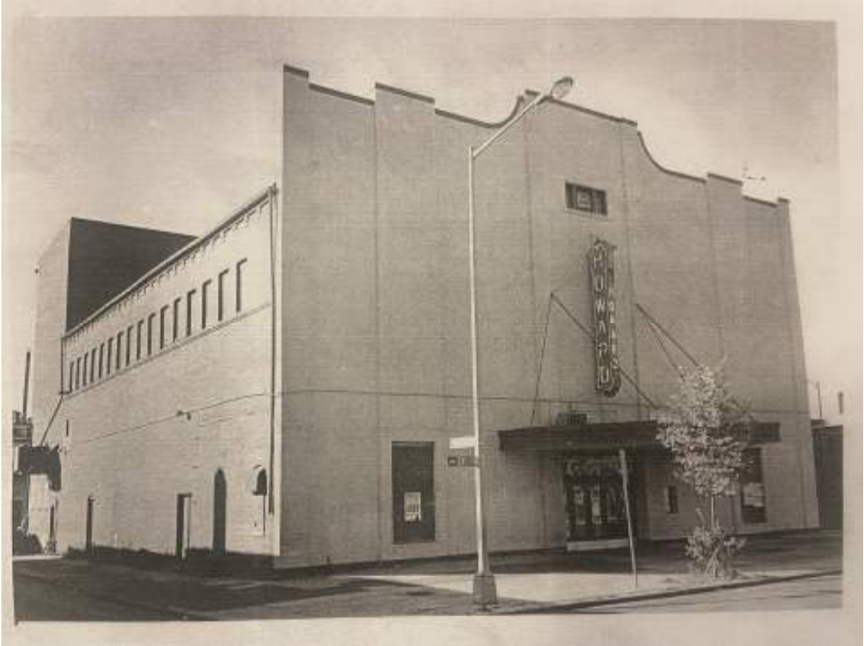
Figure 10. North and east elevations, 1978