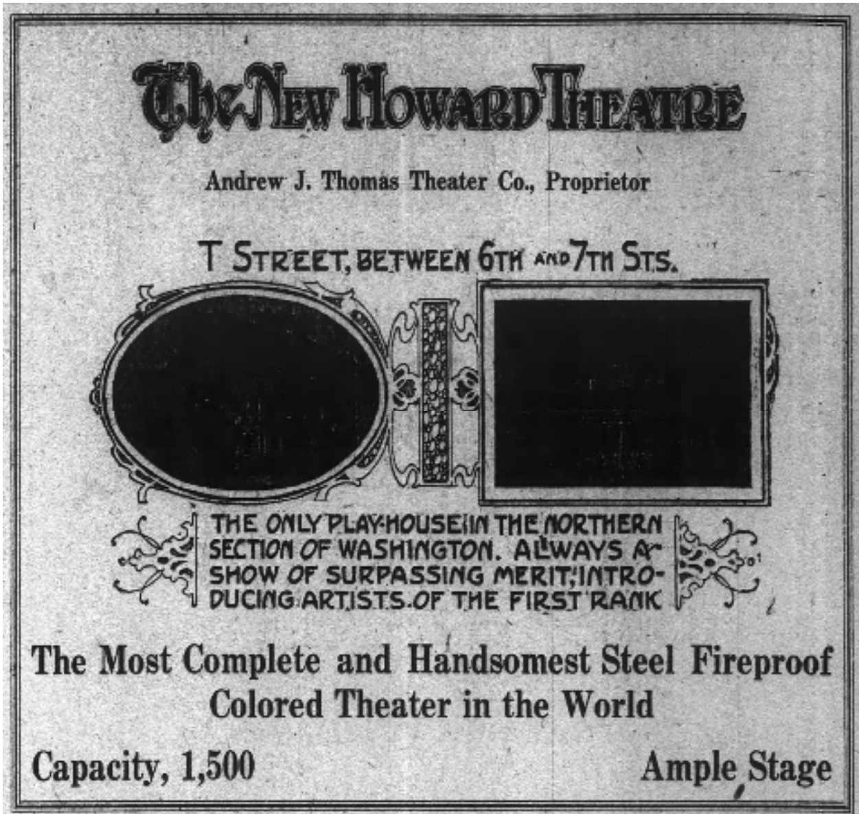
Figure 3. Advertisement for Howard Theatre published in Washington Post , May 9, 1915 ( Washington Post )