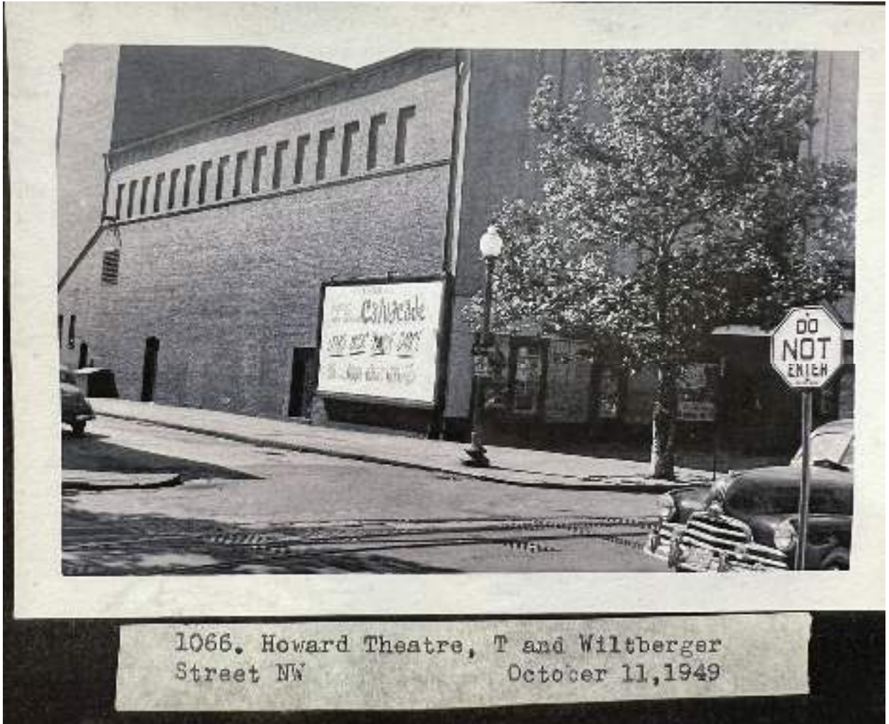
1066. Howard Theatre, T and Wiltberger Street NW October 11, 1949