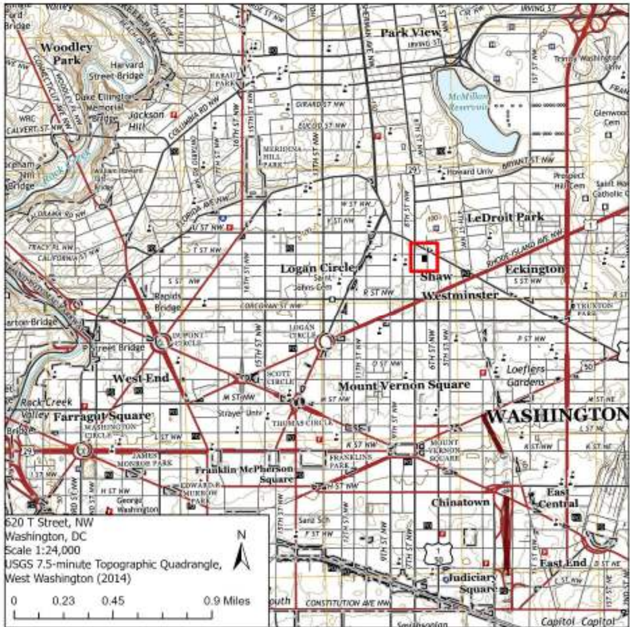
Figure 1. Locator map at 1:24,000 scale with lot darkened (ESRI)