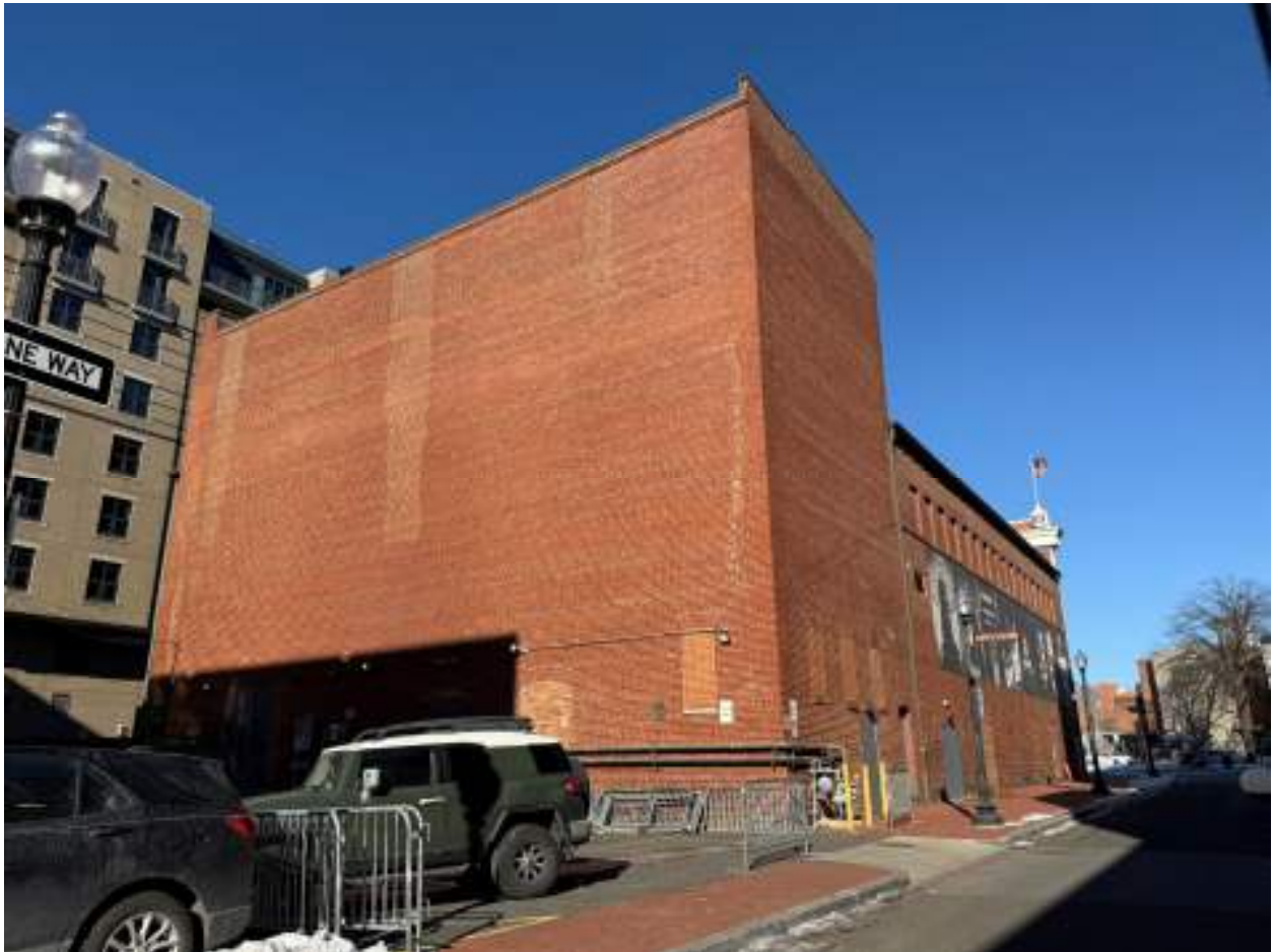
Photo #6 DC_Howard Theatre_0006 East and south elevations, looking northwest.