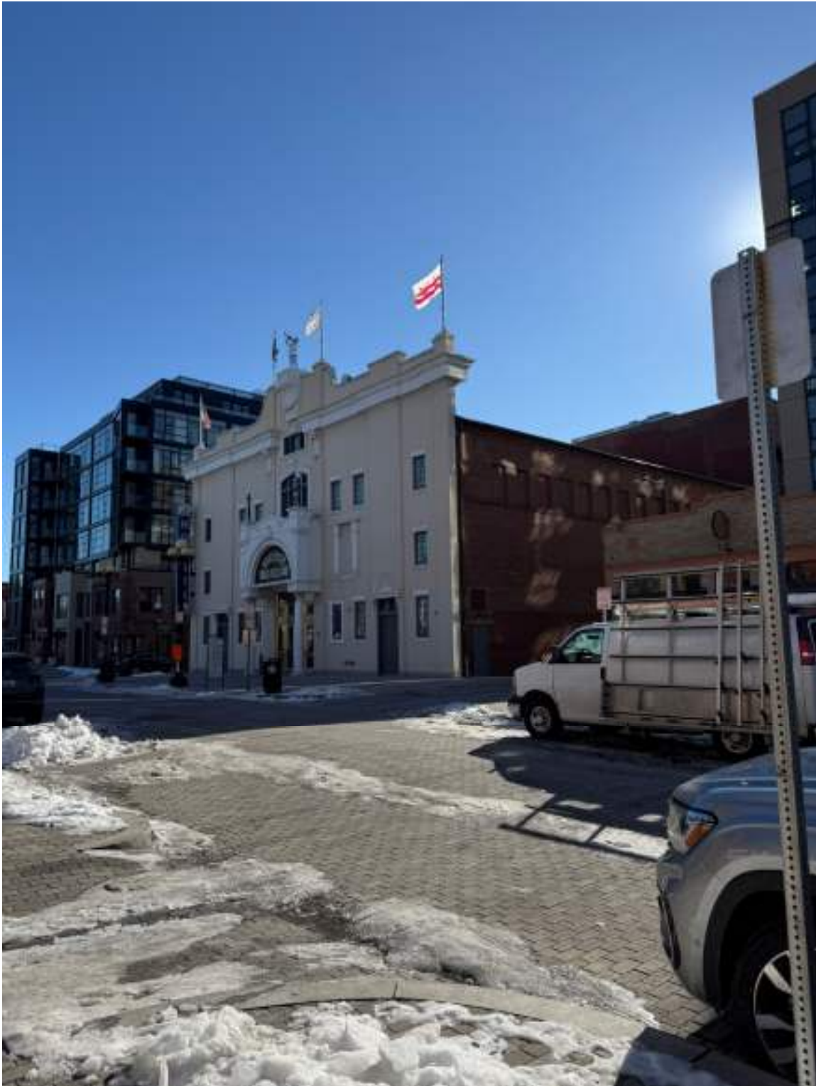
Photo #7 DC_Howard Theatre_0007 North and west elevations, looking southeast