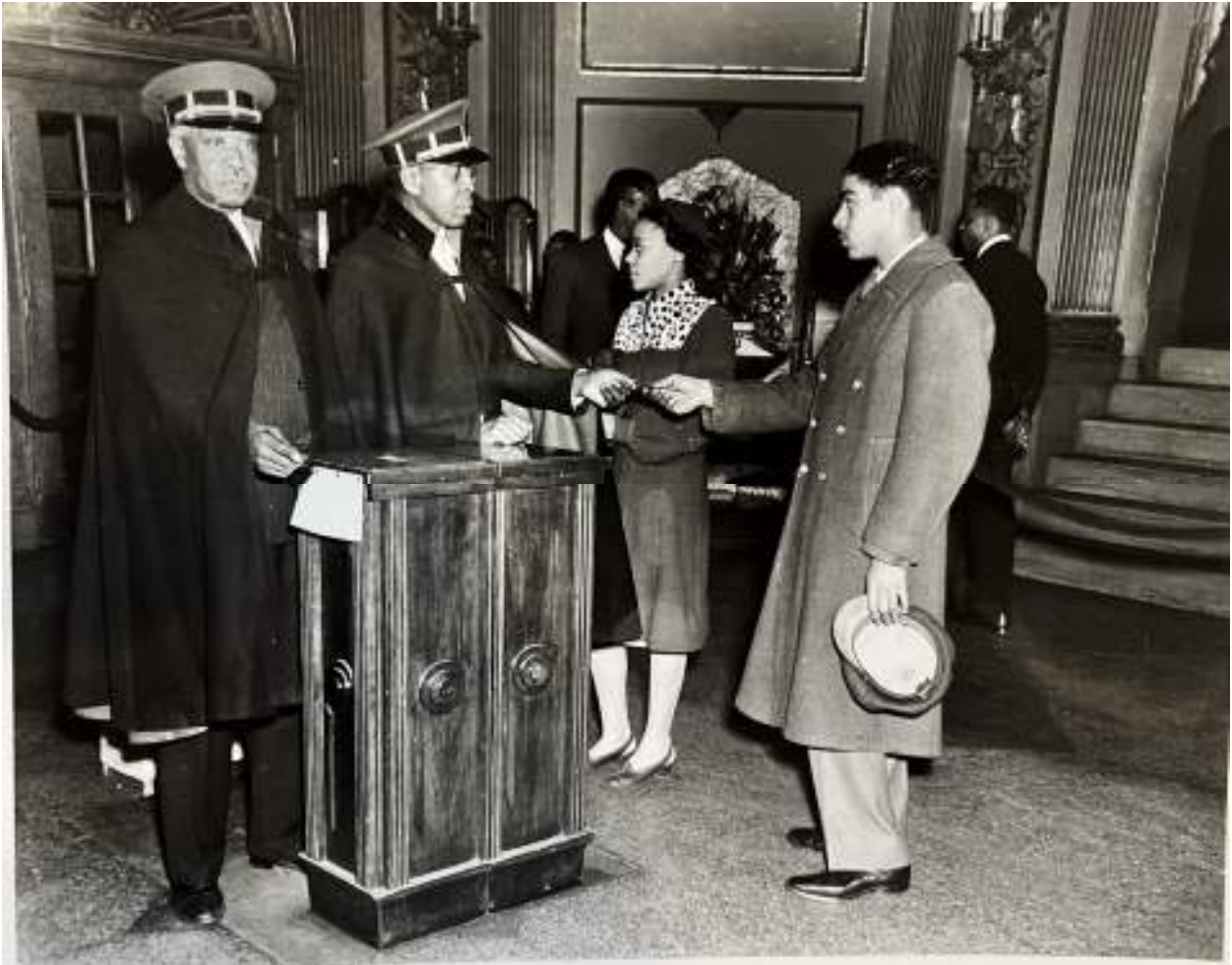
Figure 7. Interior lobby, undated, likely c. 1940s