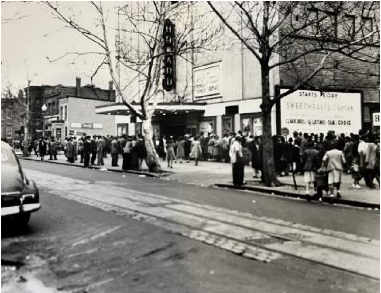
Figure 6. Exterior of theatre and T Street streetscape, c. 1940s