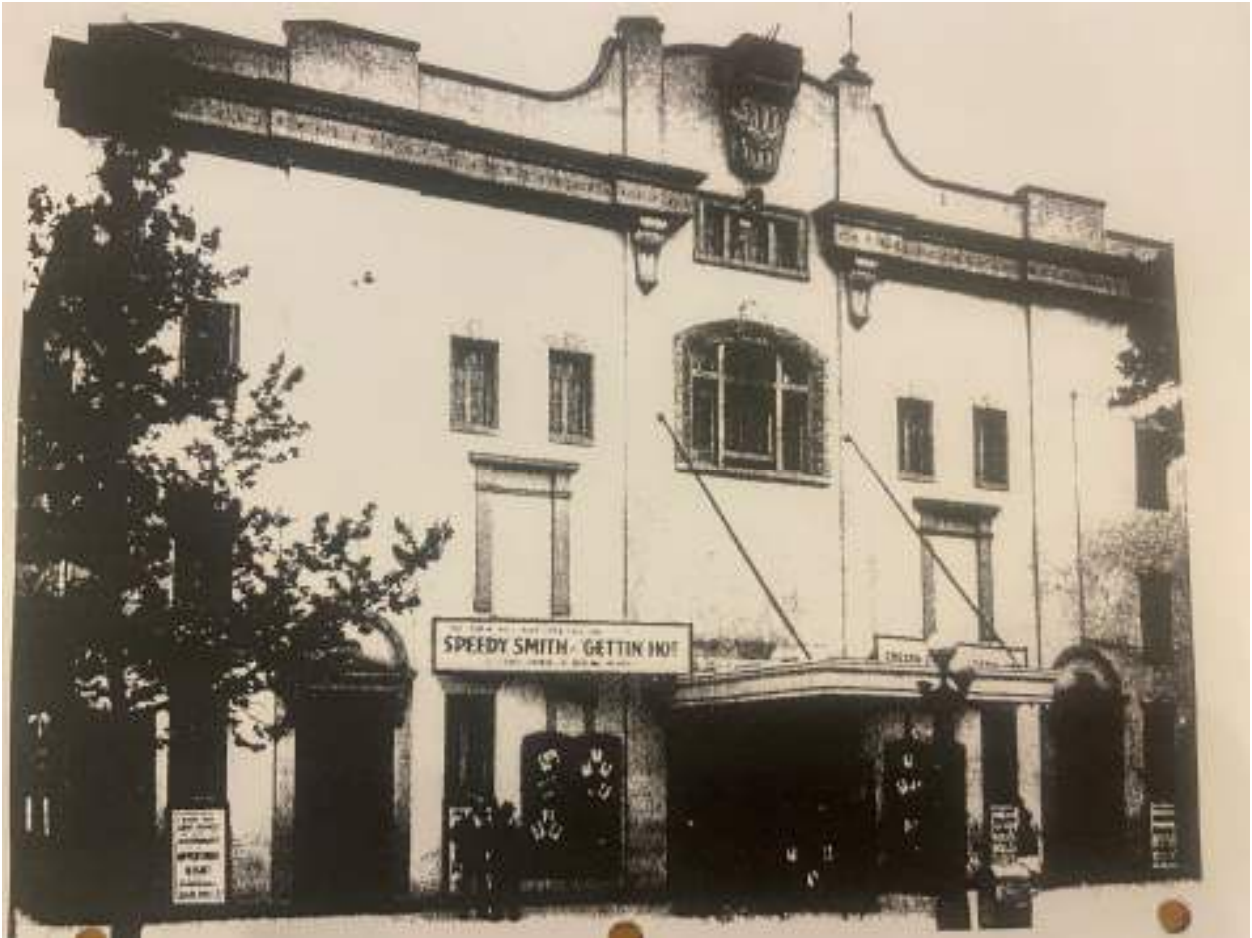
Figure 5. North Façade, c. 1930