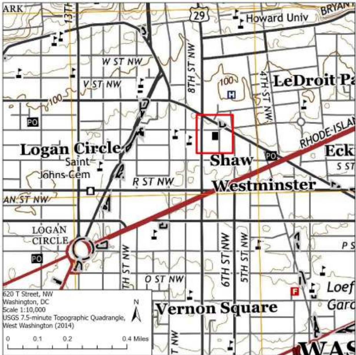
Figure 2. Locator map at 1:10,000 scale with lot darkened (ESRI)