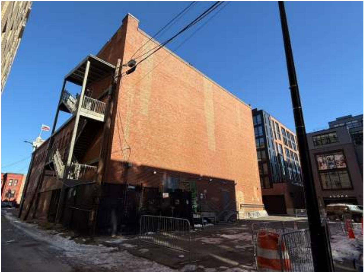
Photo #5 DC_Howard Theatre_0005 South and west elevations, looking northeast