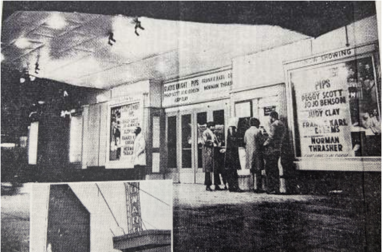
Figure 9. Customers line up at box office to buy tickets for Gladys Knight, 1969